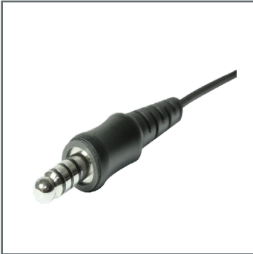
Nexus connector (Optional)