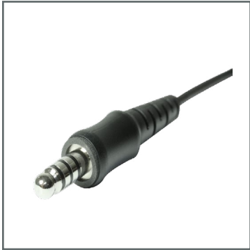
Nexus connector (Optional)